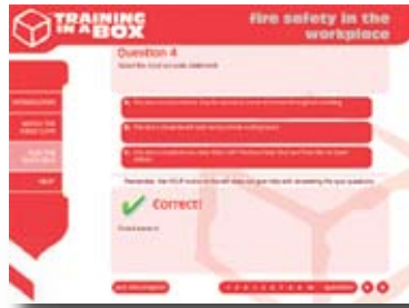
The Quiz from 'Fire Safety In The Workplace'

When they're ready there's a Quick Quiz to test their knowledge. Having demonstrated their understanding, you will then issue the written questionnaire. Once completed this is added to their training record.