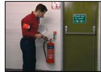
Fire Marshals - The Front Line of Defence