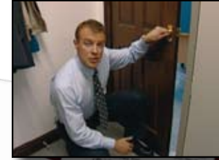
Fire Safety In The Workplace