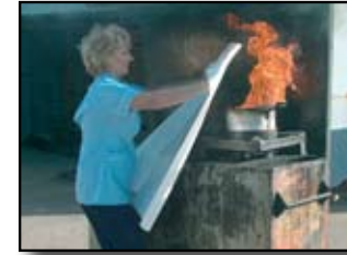
Fire Safety for Hospitals and Care Homes: Part 2