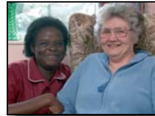
Fire Safety for Hospitals and Care Homes: Part 1

Each pack comes with a Document CD containing fact sheets, questionnaires and certificates for you to print off and use as often as you like.